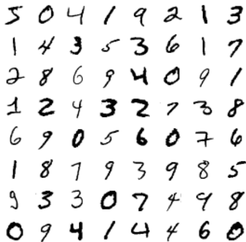
FIGURE 1. Example of handwritten digits in the MNIST dataset